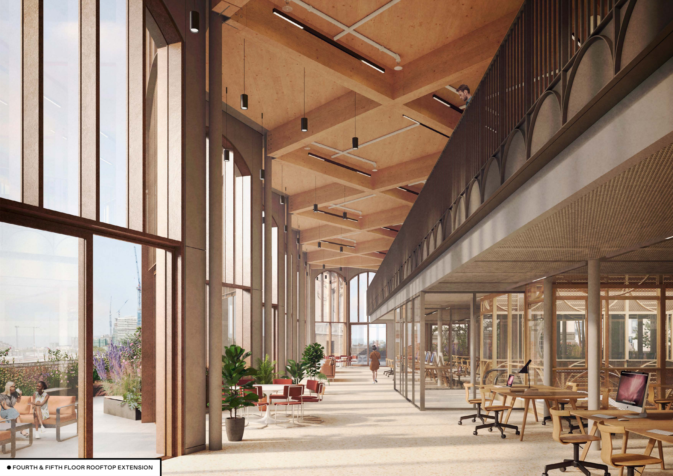
● FOURTH & FIFTH FLOOR ROOFTOP EXTENSION