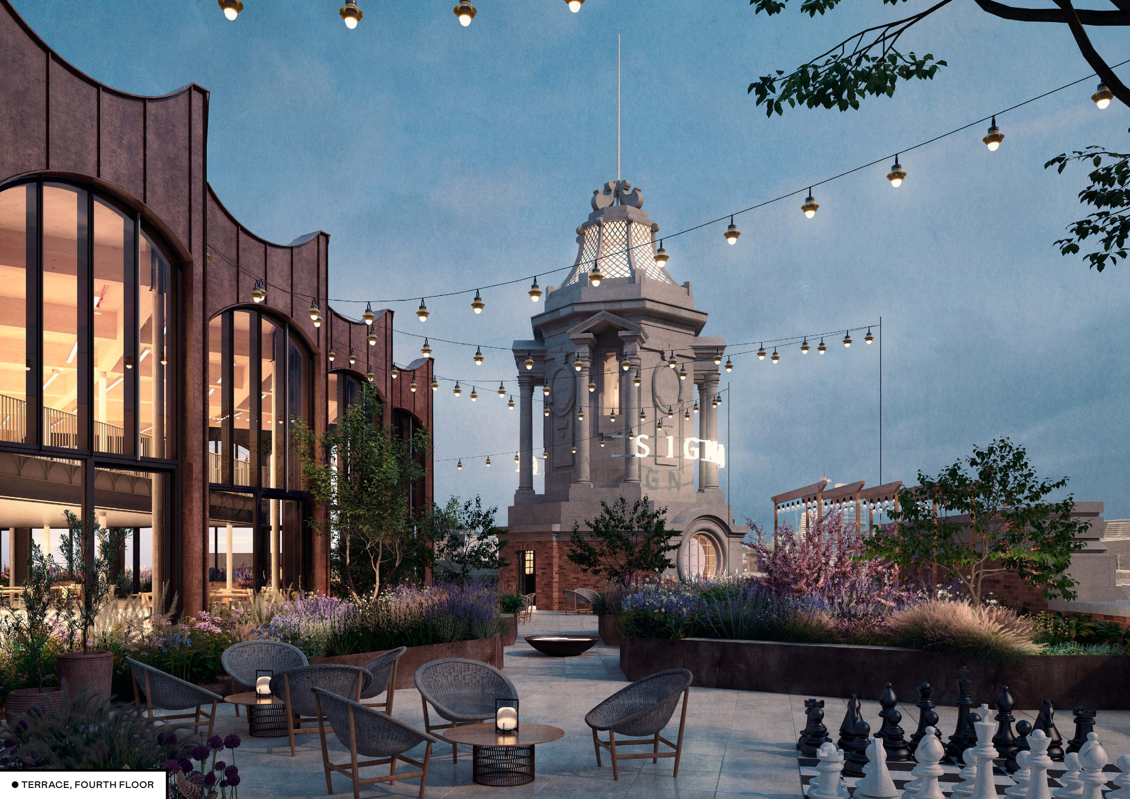
● TERRACE, FOURTH FLOOR