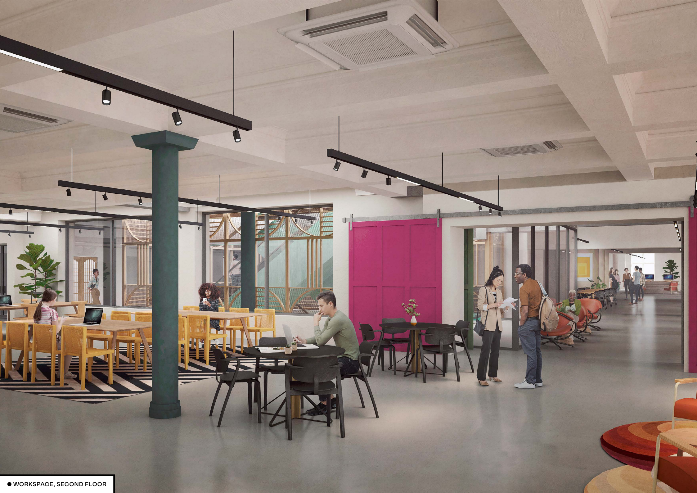
● WORKSPACE, SECOND FLOOR