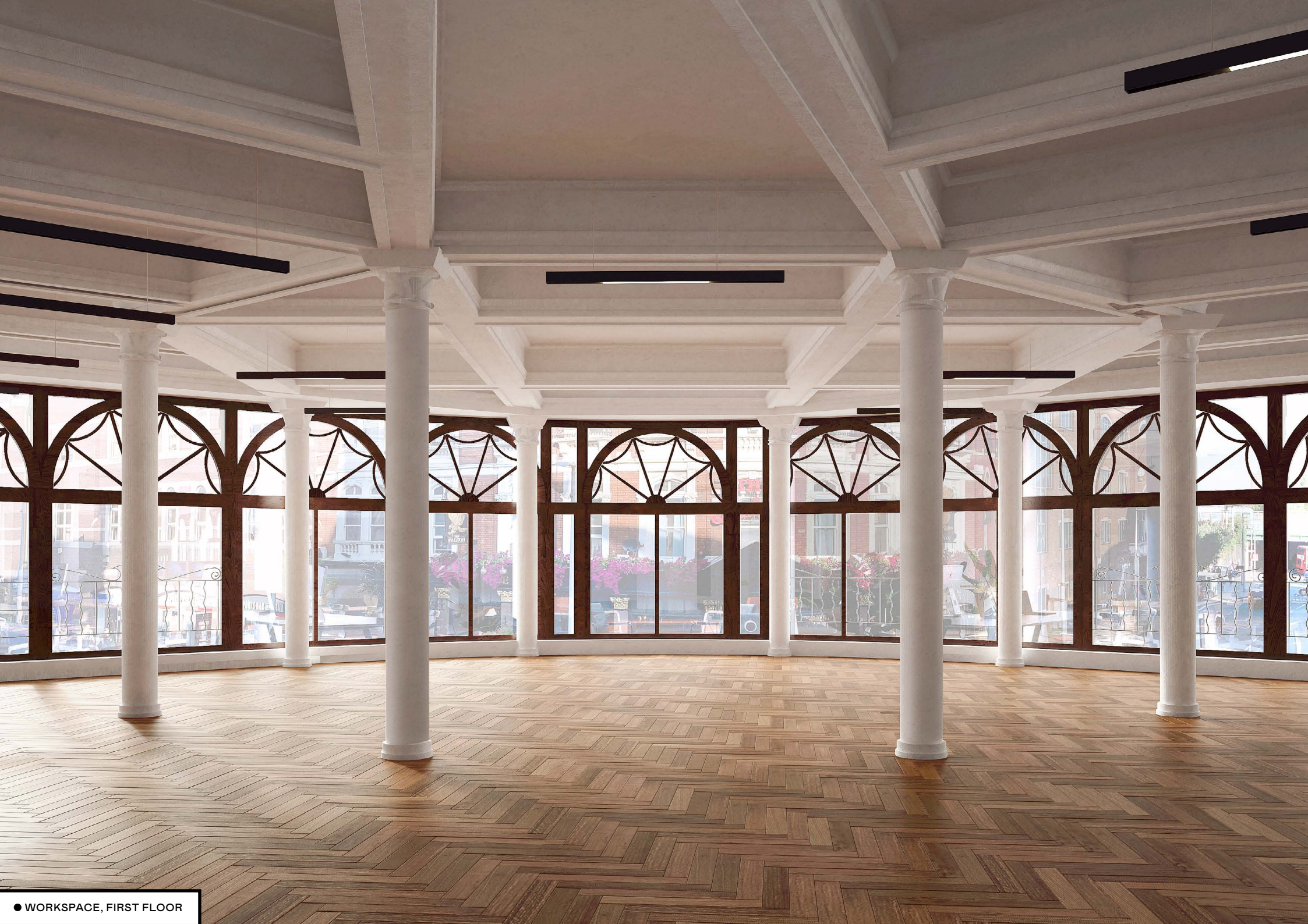
● WORKSPACE, FIRST FLOOR