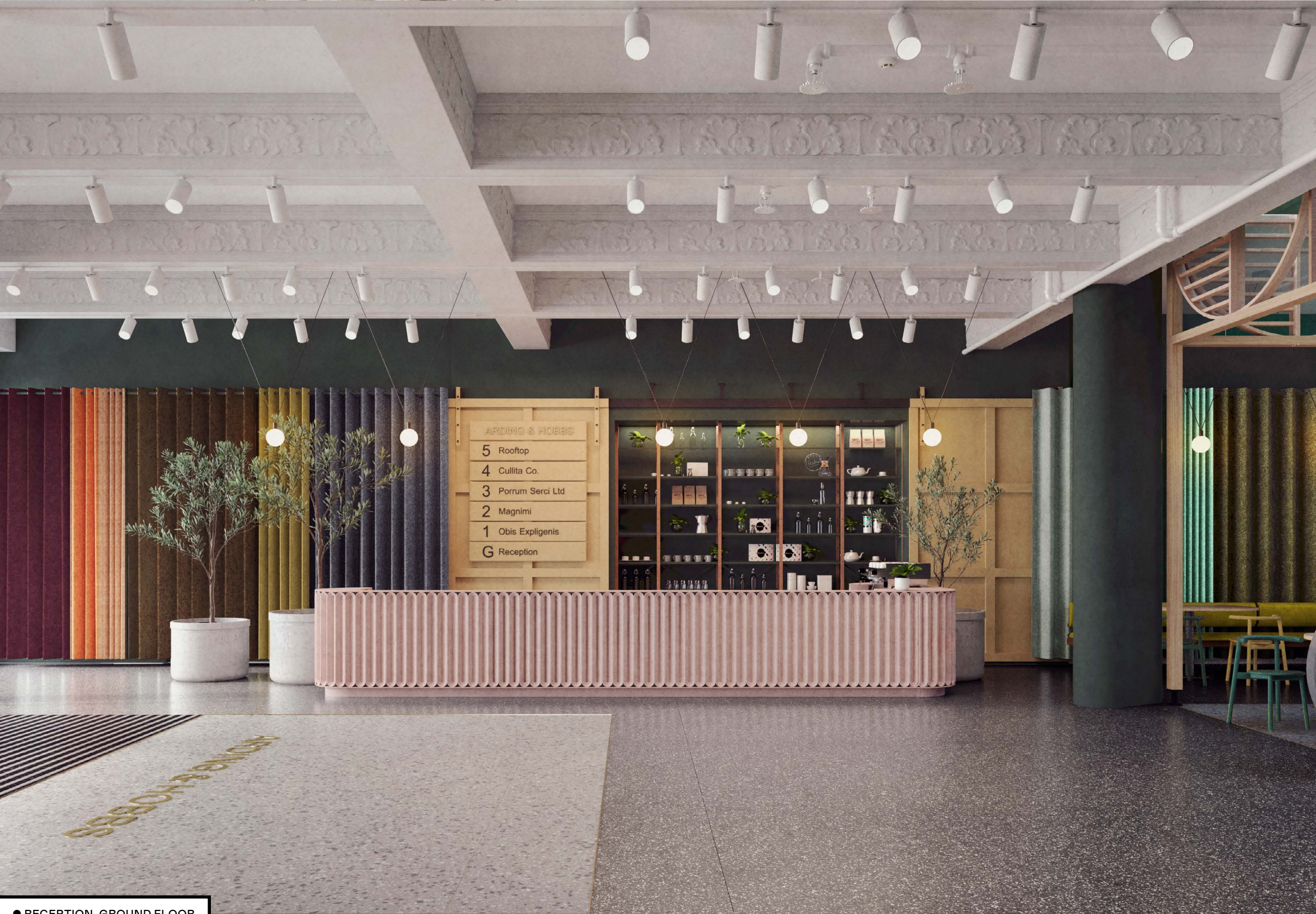
● RECEPTION, GROUND FLOOR