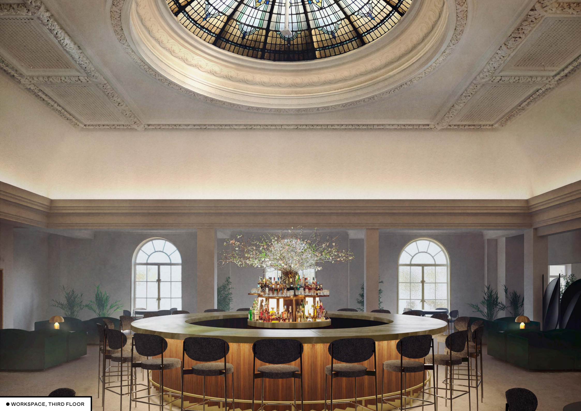
● WORKSPACE, THIRD FLOOR