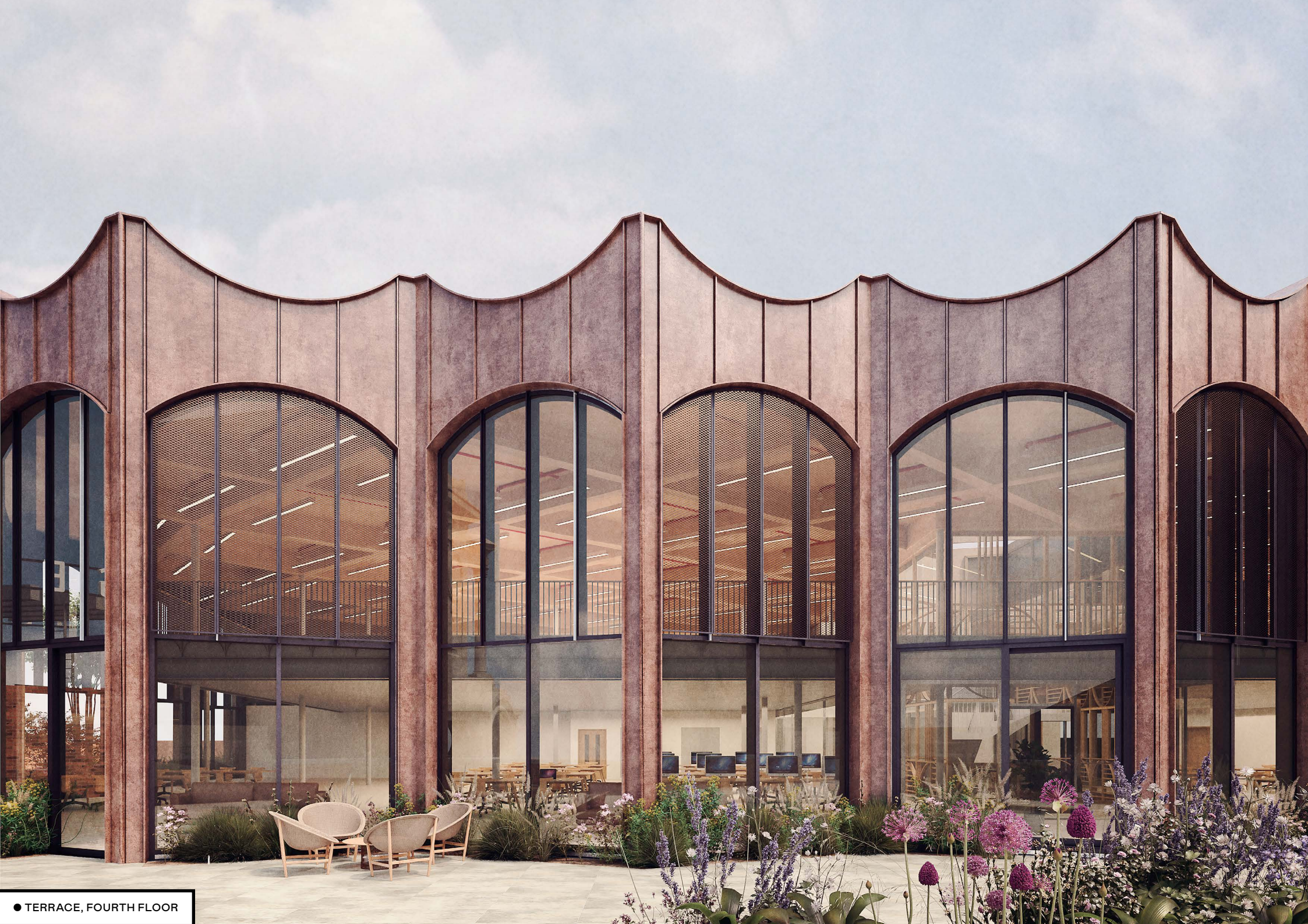
● TERRACE, FOURTH FLOOR