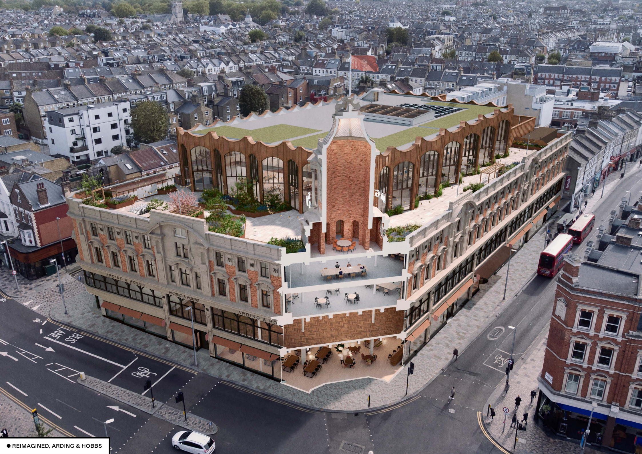
● REIMAGINED, ARDING & HOBBS